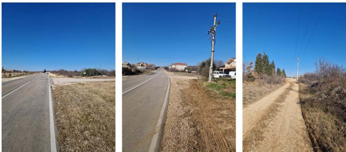
Figure 5: Planned pipeline route and area in immediate vicinity of planned route

Pipelines shall be laid in or along the roads.