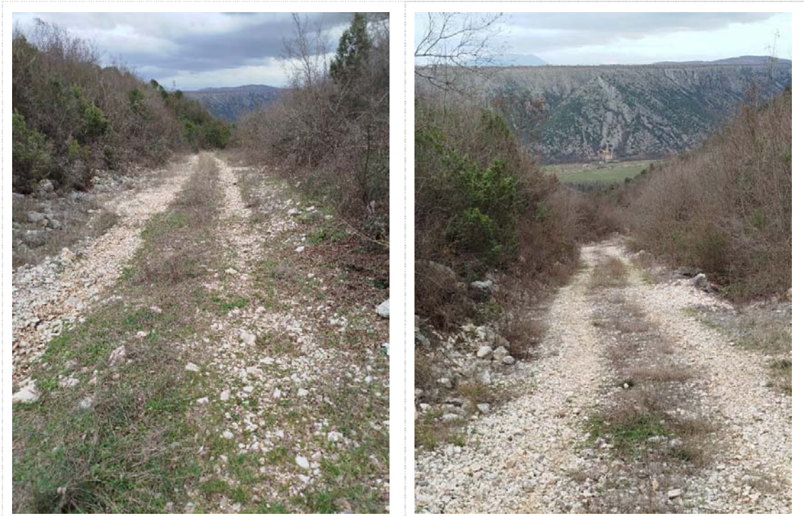
Figure 9: Planned route of the pipeline towards the pumping station