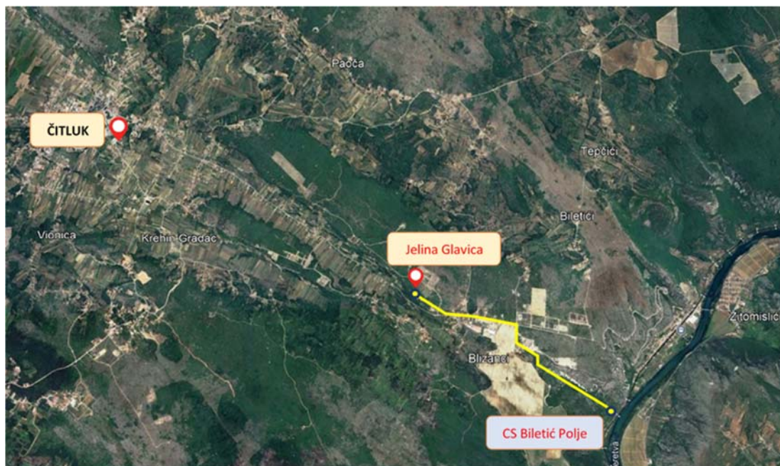
Figure 1: The location of the planned construction of the pipeline and the new water reservoir (source: GOOGLE EARTH – 2024)