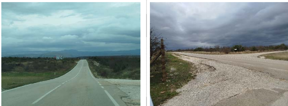
Figure 8: Location of the crossing of the pressure pipeline and regional road R425