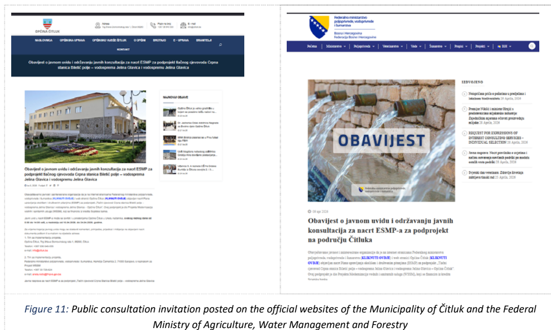
Figure 11: Public consultation invitation posted on the official websites of the Municipality of Čitluk and the Federal Ministry of Agriculture, Water Management and Forestry

Information on the public consultation invitation was posted on Brotnjo.ba and its official facebook page, a local information portal focused on the Municipality of Čitluk, Međugorje, and the wider Brotnjo area in Herzegovina, at the following link: https://brotnjo.ba/opcina-citluk-javni-uid-esmp-biletic-polje-jelina-glavica/