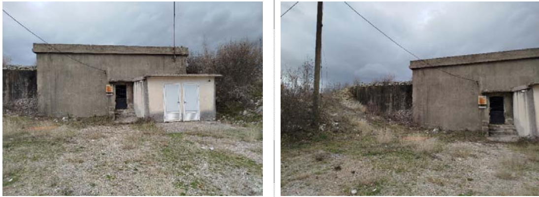
Figure 6: Location of the existing water reservoir