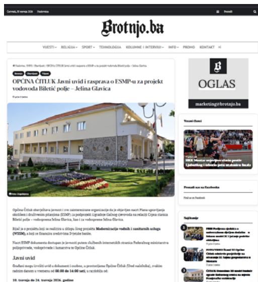
Figure 12: Public consultation invitation posted on the website Brotnjo.ba

Information on the public consultation invitation was posted on Brotnjo.ba and its official facebook page, a local information portal focused on the Municipality of Čitluk, Međugorje, and the wider Brotnjo area in Herzegovina, at the following link: https://brotnjo.ba/opcina-citluk-javni-uid-esmp-biletic-polje-jelina-glavica/