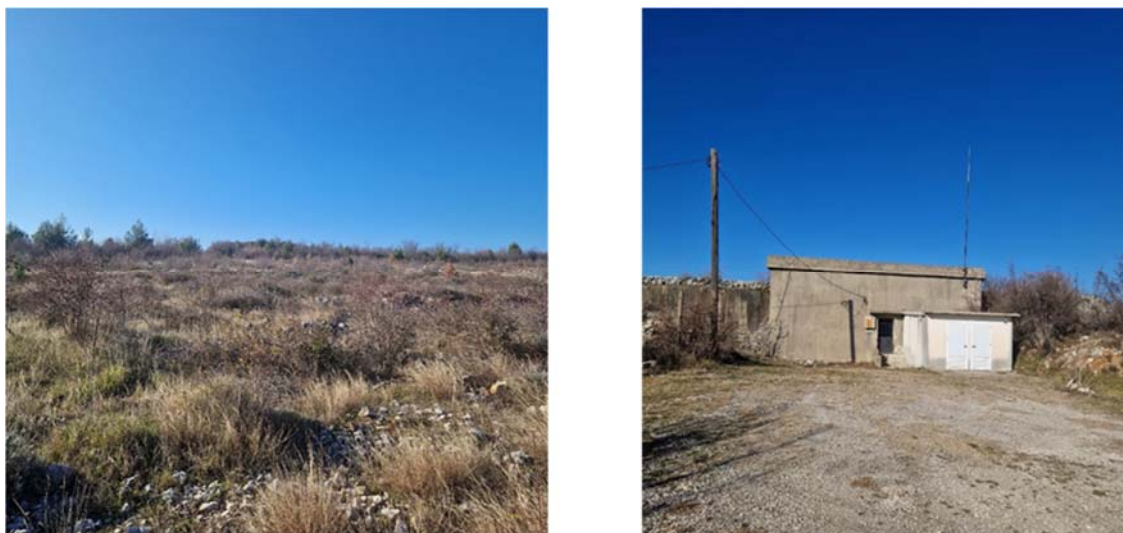
Figure 4: Location of existing and area for construction of new reservoir 2

Pipelines shall be laid in or along the roads.