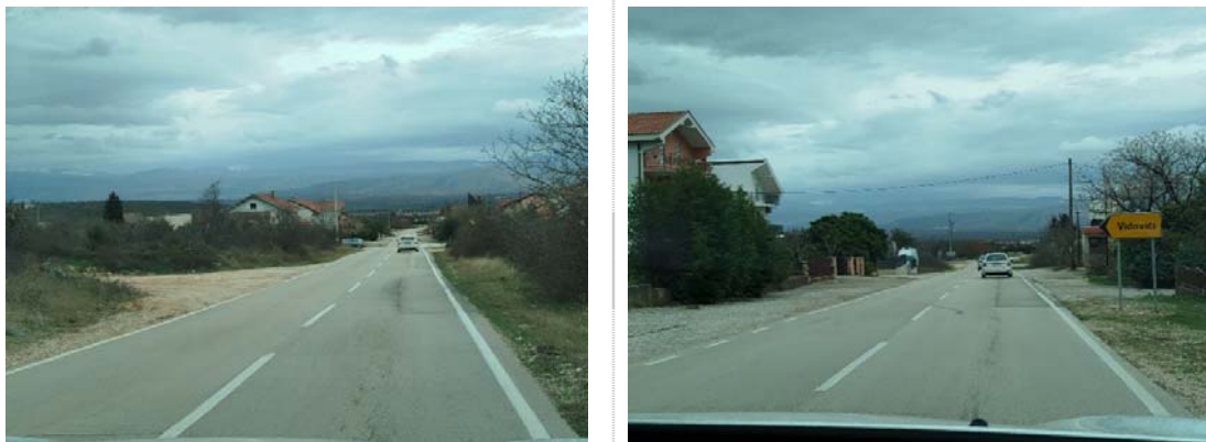
Figure 7: Planned route of the pipeline along regional road R425