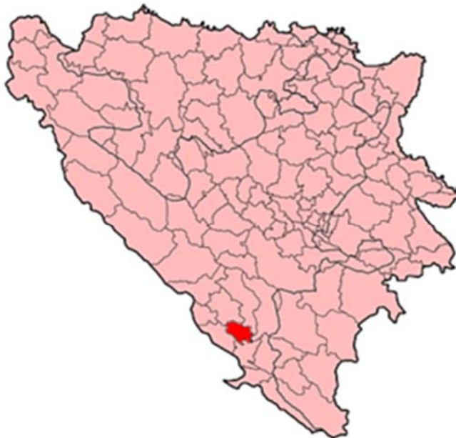
Figure 2: Geographical location of the Municipality of Čitluk in BiH

Municipality Čitluk (Brotinjo) is part of Herzegovina-Neretva County (Federation of Bosnia and Herzegovina) and covers an area of 181 km 2 . The municipality of Čitluk borders the cities: Mostar, Čapljina, Ljubuški and Široki Brijeg. Terrain descends towards Mostarsko Blato northeast of the Municipality and southwest towards Trebižat Valley, and on its southeast side towards the course of the Neretva River.