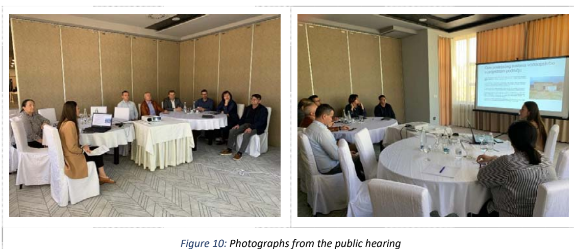
Figure 10: Photographs from the public hearing

Photographs from the public hearing are presented below.